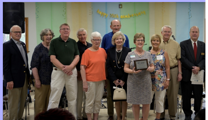
Current and former RHSC Board Presidents and Executive Directors celebrate the occasion.

RHSC was first officially accredited by the National Institute of Senior Centers in 2001 as the 55th in the nation and only Center in North Carolina to be accredited until 2009. RHSC celebrated its fifth accreditation in 2023; continuing its accreditation status for 22 years!